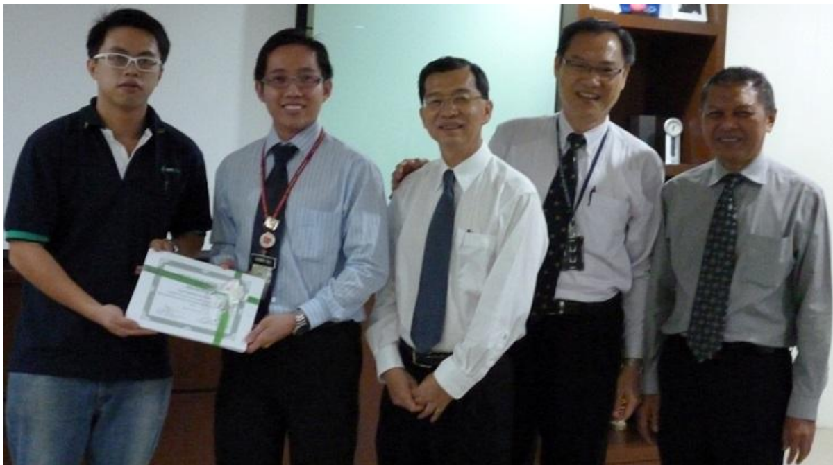
Presentation of certificates with MAPS office bearers